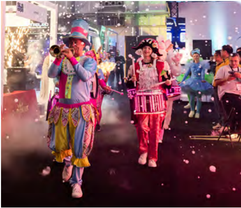
SEA Expo 2024, Riyadh, Saudi Arabia

Attendees can explore industry-advancing technologies, discover emerging trends, and network with key stakeholders. The Expo reinforces the Kingdom's leadership in addressing global challenges and advancing development in entertainment and leisure.