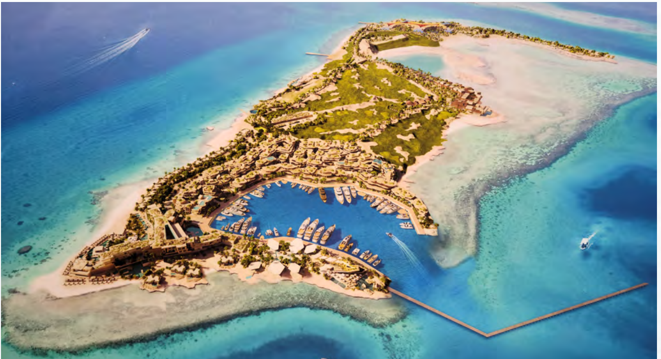
Red Sea Project, Saudi Arabia

The Kingdom of Saudi Arabia (KSA) is investing heavily in large-scale entertainment projects that this article will touch on, including the Red Sea Project and NEOM, which aim to create unique attractions that draw both local and international visitors.