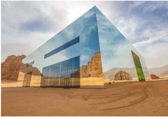
Maraya, AlUla, Saudi Arabia

When attractions reflect local culture and heritage, they instil pride within communities. For example, AlUla, home to ancient Nabatean tombs and rock art sites, has been transformed into a cultural tourism hotspot. Guided tours are micro events that emphasise AlUla's historical significance while celebrating its unique place in Saudi identity.