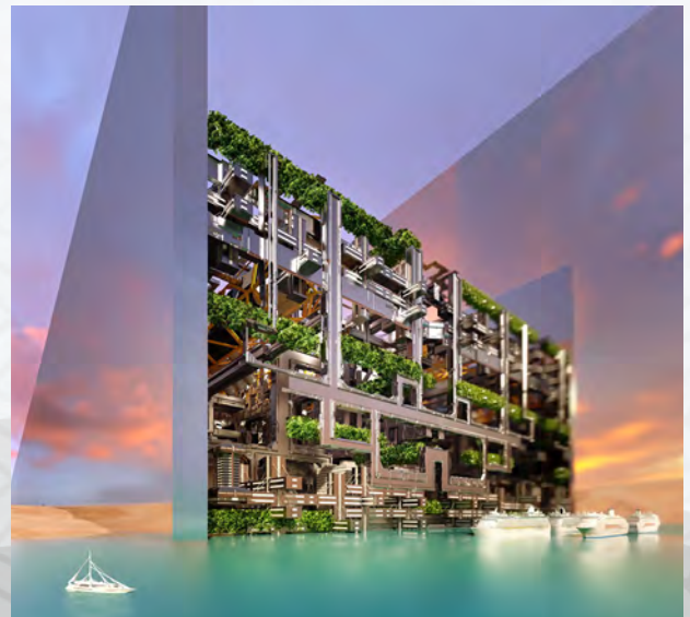
The Line, Neom, Saudi Arabia

Similarly, Diriyah Gate blends preservation with innovation by revitalising historic areas into vibrant cultural hubs. Another way of preserving heritage in attraction design is, of course, storytelling.