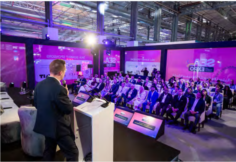
SEA Expo 2024, Riyadh, Saudi Arabia

Attractions must focus on authenticity to resonate with regional audiences. Riyadh Season skilfully incorporates elements of traditional Saudi hospitality alongside modern entertainment offerings. This blend appeals to domestic visitors seeking familiarity and international tourists eager for authentic experiences.