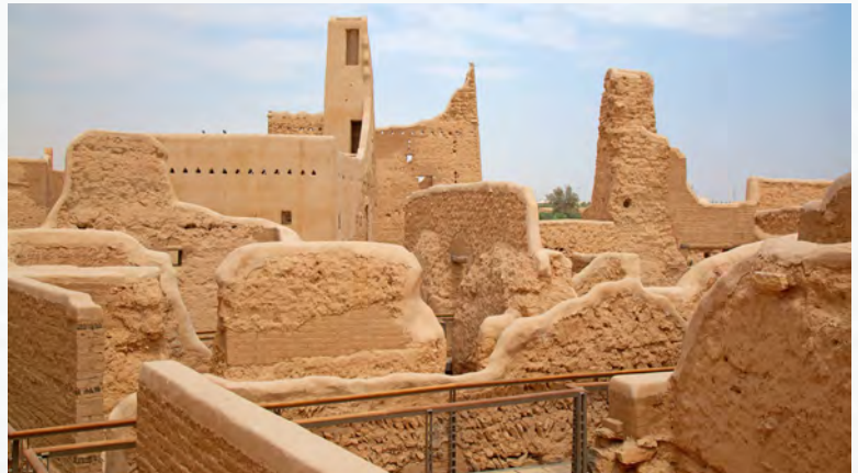
Diriyah Gate, Diriyah, Saudi Arabia

Similarly, Qiddiya, an entertainment megaproject near Riyadh, integrates traditional Saudi arts and crafts into its design. Through live performances and interactive exhibits, Qiddiya offers visitors an authentic glimpse into the Kingdom's cultural richness while positioning itself as a world-class leisure destination